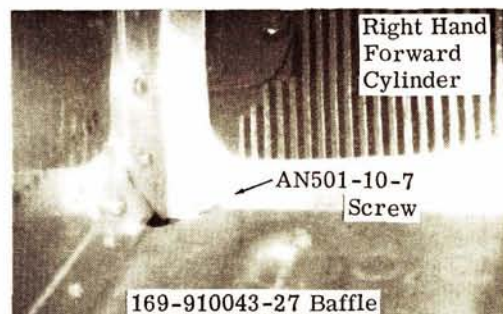
Figure 2 View through nose cowling